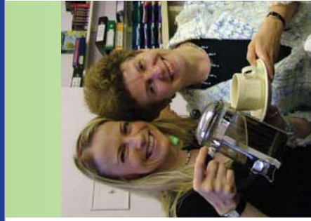
The staff at Farnborough Hill enjoyed their 9th year of taking part in The World's Biggest Coffee Morning and raised £234.95 for Macmillan Nursing.