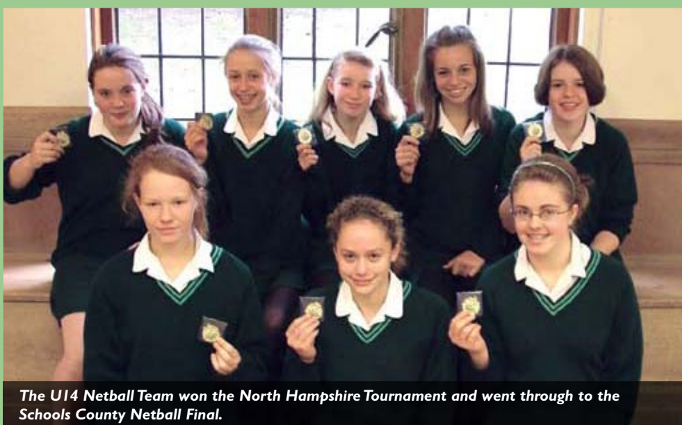
The U14 Netball Team won the North Hampshire Tournament and went through to the Schools County Netball Final.