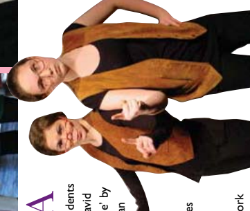
Above: 'You Made Me' Below: Technical team