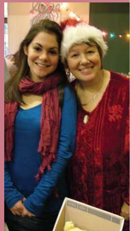
The Christmas Bazaar raised over £2,000 for the House Charities.