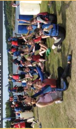
Winning team in the raft building race at Horseshoe Lake.